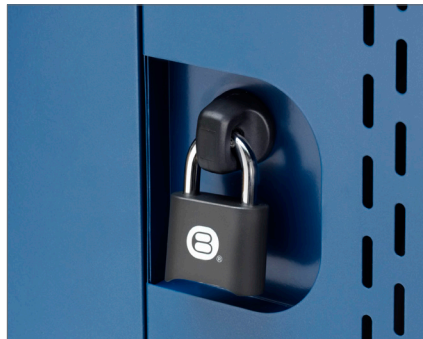
Inserting The Shackle / Lock Programming