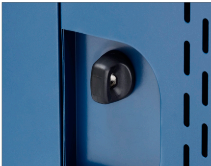
Using the Handle

Polypropylene dividers store devices vertically and offer optimal spacing for device compatibility.